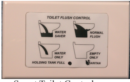
Smart Toilet Control